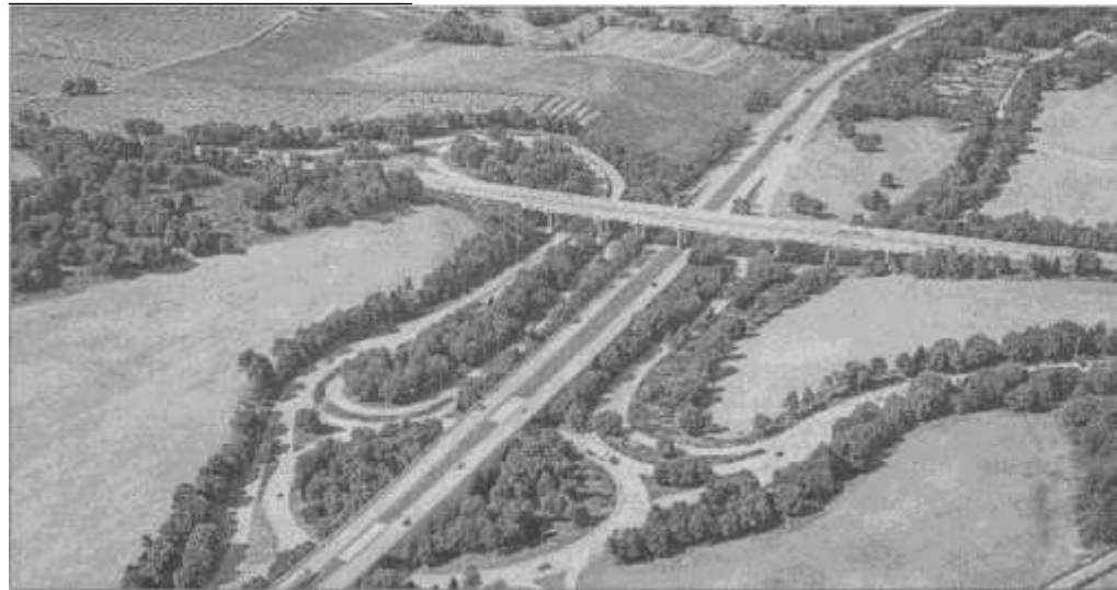
An artist's impression of the new flyover at Stockbury Roundabout

ted to making major improvements to the Stockbury and we are set to publish detailed